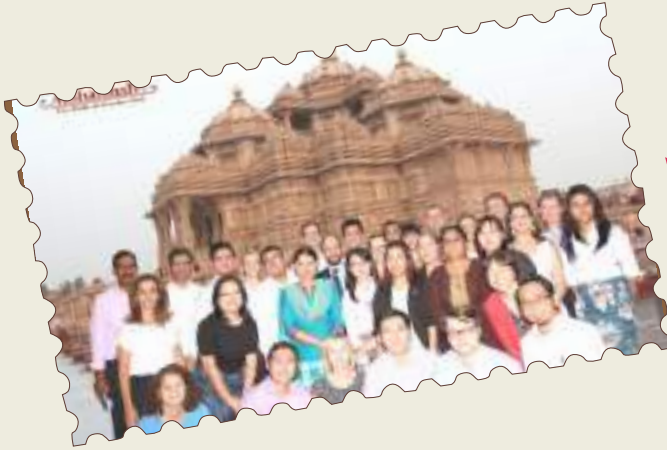
Visit of ASEAN and ASEM Member States' participants to Akshardham, Delhi