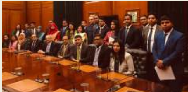
Bangladeshi diplomats called on Shri Vijay Gokhale, Foreign Secretary.