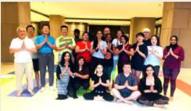
Diplomats from ASEAN countries participated in Yoga Session