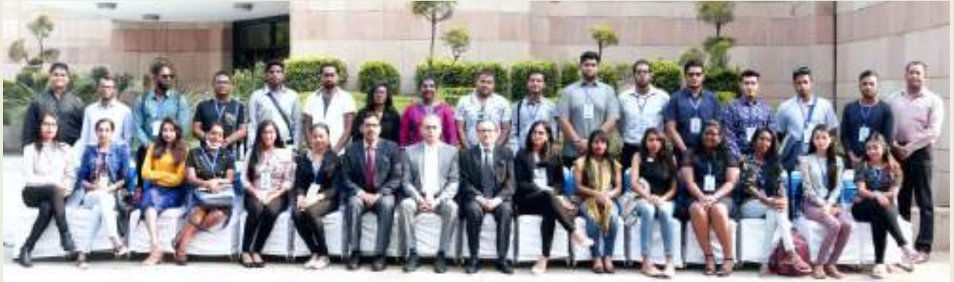
Participants of the 56th KIP visited FSI on 17 October 2019.

Know India Programme (KIP) is a flagship initiative for diaspora engagement which familiarises Indian-origin youth (18-30 years) with their Indian roots and contemporary India, through a 25 days orientation programme organised by MEA. 3 KIP groups underwent a one-day familiarisation programme at FSI in October-December 2019.