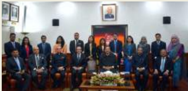
Bangladeshi diplomats called on Hon'ble Vice President Shri Venkaiah Naidu