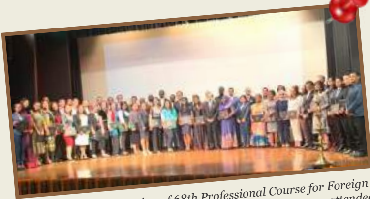
The Valedictory Function of 68th Professional Course for Foreign Diplomats was at FSI on 11 October 2019. The Course was attended by 55 Diplomats from 54 countries.