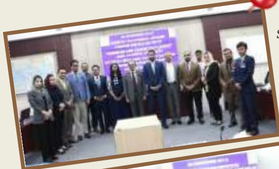
The Valedictory Session of 2nd India-China Joint Capacity Building Programme for Diplomats from Afghanistan on 22 November 2019.