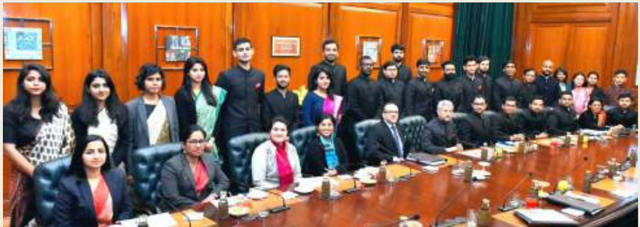
IFS OTs call on Hon'ble EAM