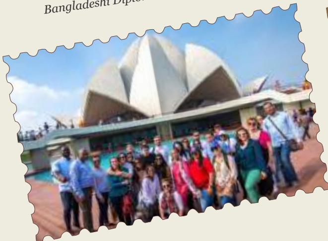
Visit of 68th PCFD participants to Lotus Temple, Delhi