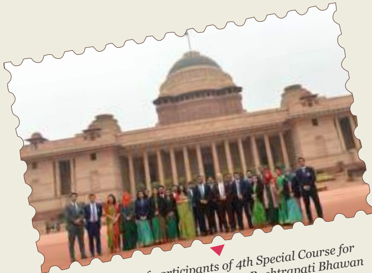
Visit of participants of 4th Special Course for Bangladeshi Diplomats to Rashtrapati Bhawan