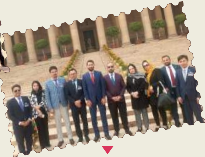
Visit of participants of 2nd India-China Joint Capacity Building Programme for Afghan Diplomats to Rashtrapati Bhawan.