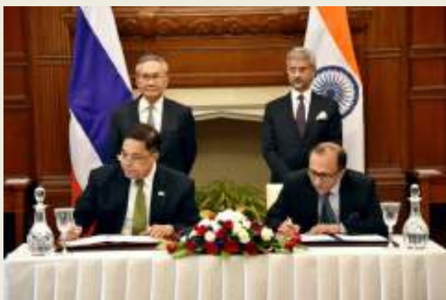
Signing of MoU with Thailand