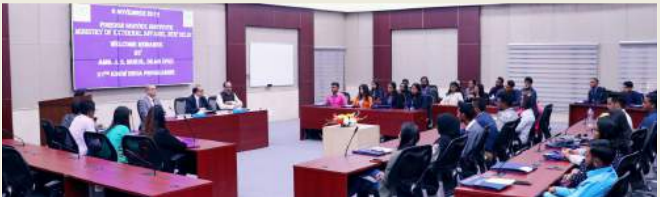
Participants of the 57th KIP visited FSI on 6 November 2019.