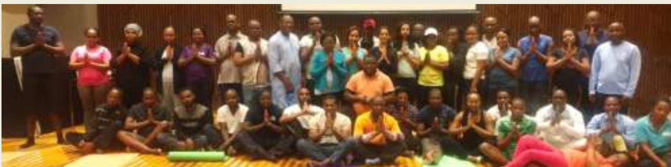
Diplomats from Central & West Africa Francophone countries participated in Yoga Session