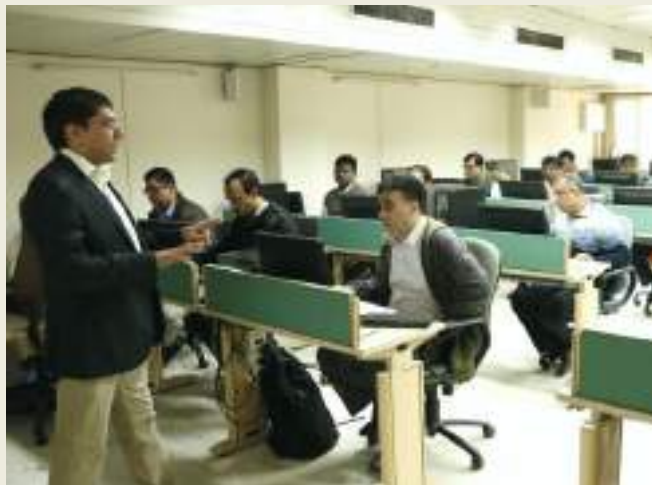
Participants of IMAS undergoing hands-on training