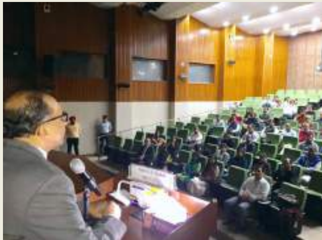
Dean (FSI) welcoming participants of Accounts Training Programme