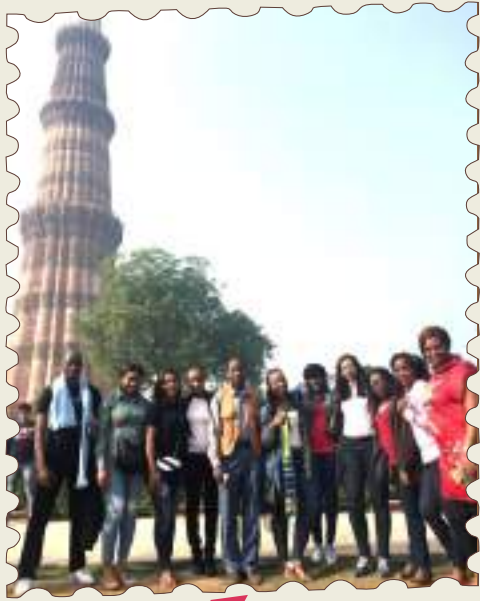
Participants of Central & West Africa Francophone countries visited Qutab Minar, Delhi.