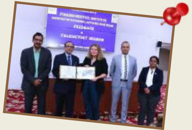
The Valedictory session of 5th Special Course for ASEM (Asia-Europe Meeting) Diplomats held on 18 October 2019.