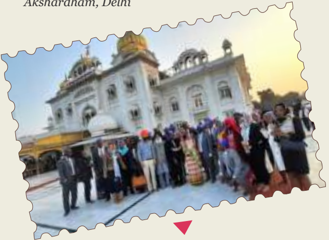
Visit of participants of Central & West Africa Francophone countries to Bangla Sahib Gurudwara, New Delhi.