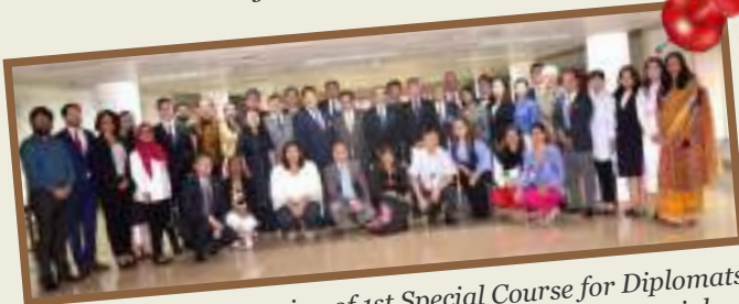
The Valedictory Session of 1st Special Course for Diplomats from Dominican Republic, Mongolia and 3rd Special Course for Diplomats from Maldives held on 8 November 2019.