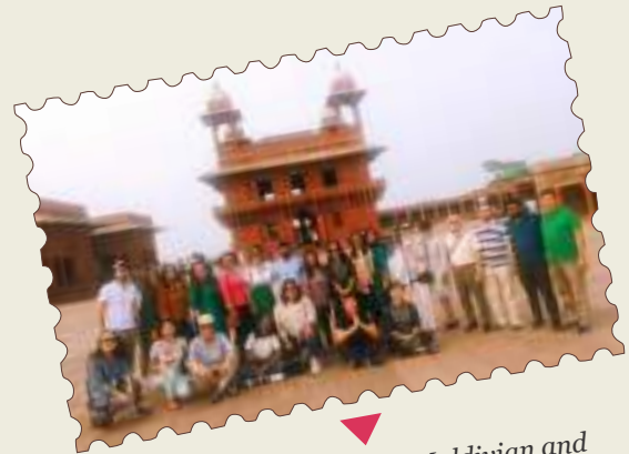
Visit of Mongolian, Maldivian and Dominican Republic diplomats to Fatehpur Sikri, Agra.