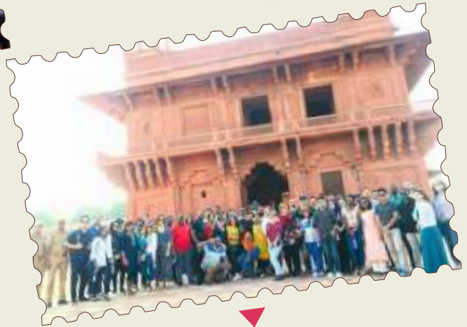
Visit of 68th PCFD participants to Fatehpur Sikri, Agra