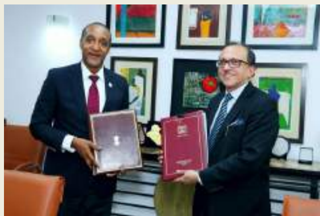
Signing of MoU with Kenya