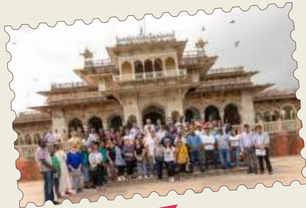
Visit of 68th PCFD participants to Jaipur.