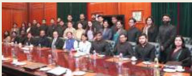
IFS OTs call on Hon'ble MoS for External Affairs