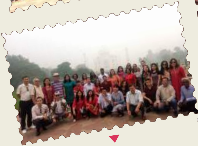
Visit of Mongolian, Maldivian and Dominican Republic participants to Taj Mahal, Agra