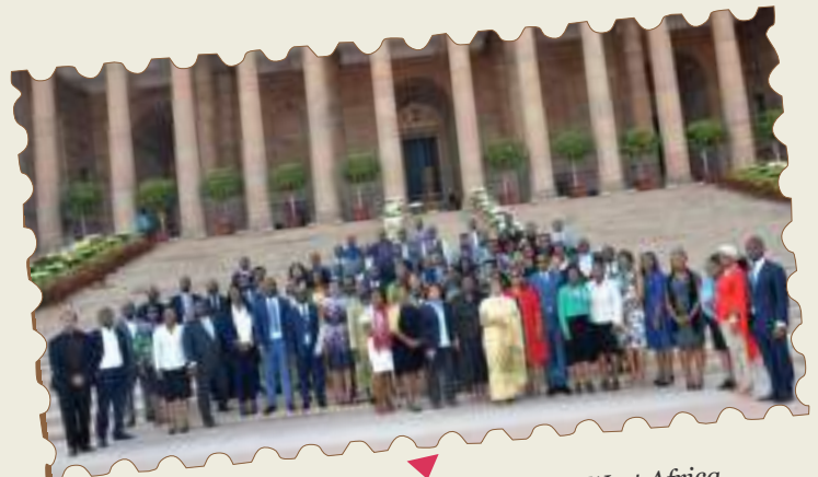
Visit of participants of the Central & West Africa Francophone countries to Rashtrapati Bhawan.