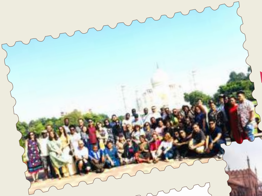
Visit of 68th PCFD participants to Taj Mahal, Agra