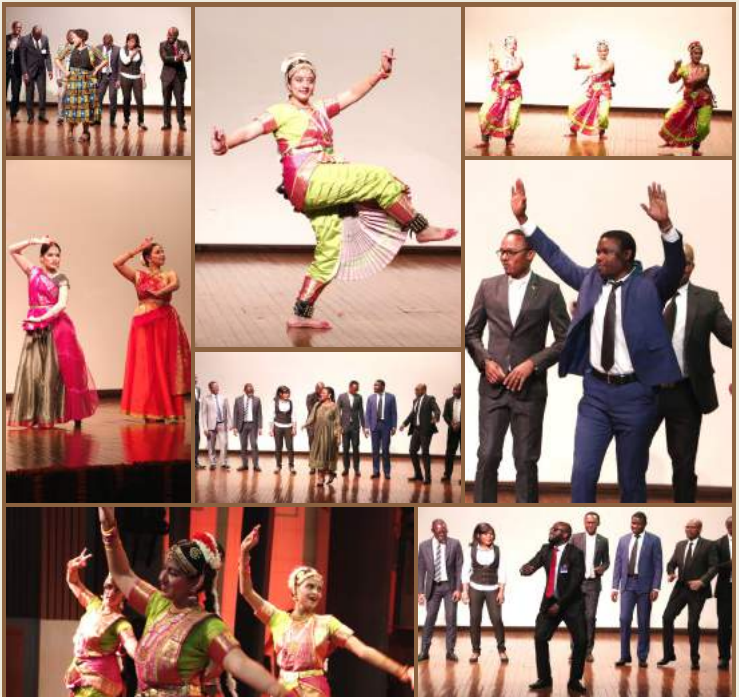
A cultural programme was organised during the valedictory function of 68th PCFD on 11 October 2019. Participating diplomats also put up a couple of performances.