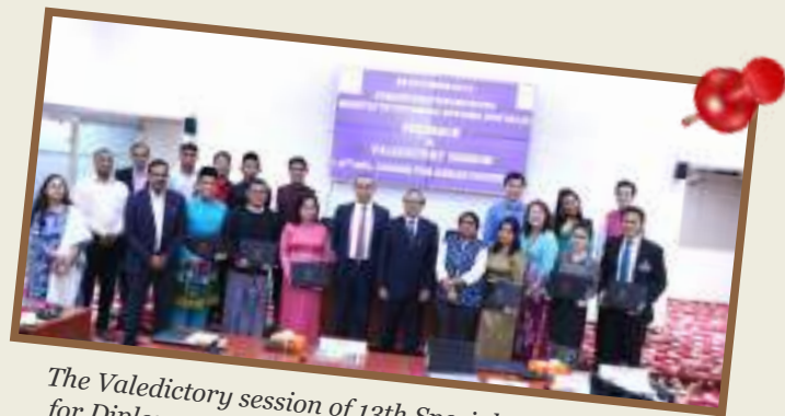
The Valedictory session of 13th Special Course for Diplomats from ASEAN region held on 25 October 2019.