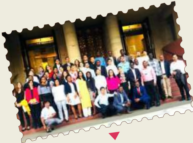
Visit of 68th PCFD participants to National Museum, New Delhi