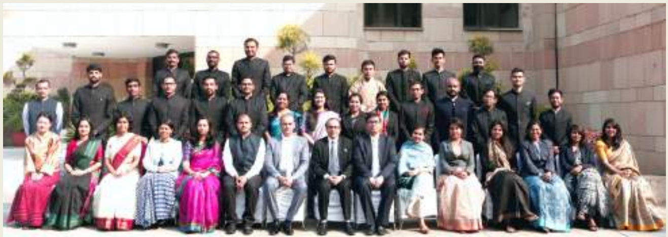
The first day of IFS OTs at FSI

The Induction Training Programme (ITP) for 30 Indian Foreign Service (IFS) Officer Trainees (OTs) and 2 diplomats from Bhutan commenced on 09 December 2019 at FSI. The OTs and Bhutanese diplomats called on Dr. S. Jaishankar, Hon'ble External Affairs Minister (EAM), Shri V. Muraleedharan, Hon'ble Minister of State for External Affairs (MoS) and Shri Vijay Gokhale, Foreign Secretary (FS). The orientation module of the ITP concluded in end-December 2019.