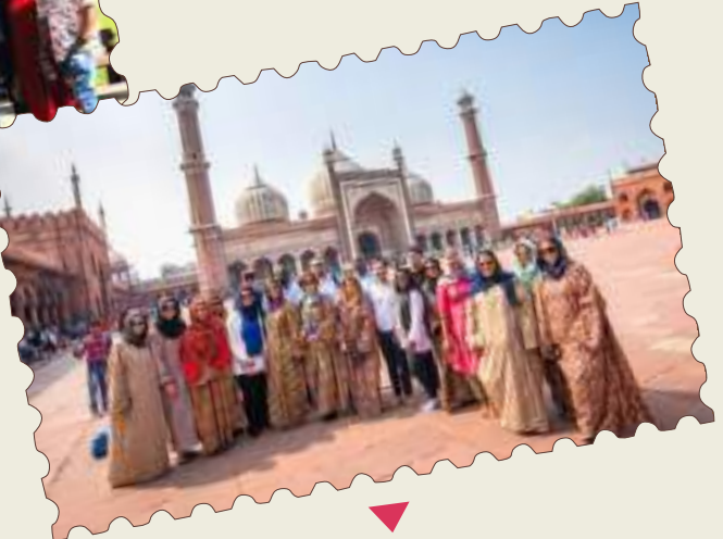
Visit of 68th PCFD participants to Jama Masjid, Delhi