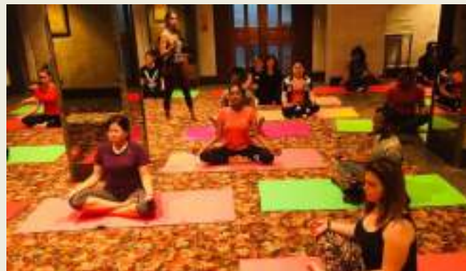
Participants of 68th PCFD participated in a Yoga session