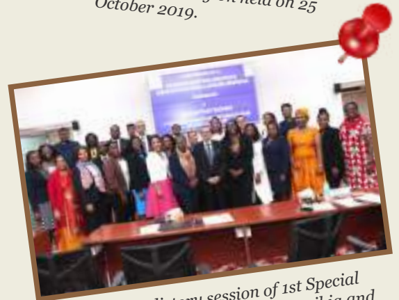
The Valedictory session of 1st Special Course for Diplomats from Namibia and Malawi held on 13 December 2019.