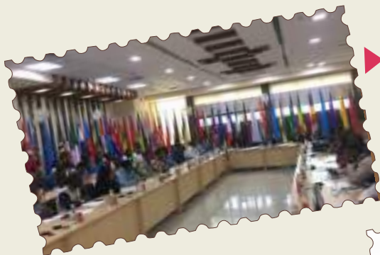
Visit of participants of Central & West Africa Francophone countries to International Solar Alliance (ISA), Gurugram, Haryana.