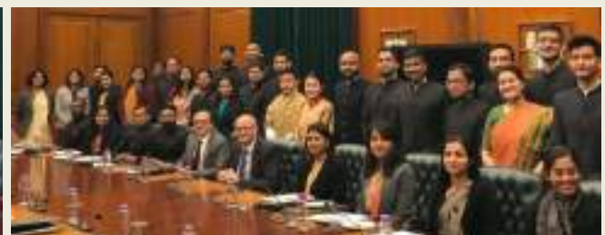
IFS OTs call on FS