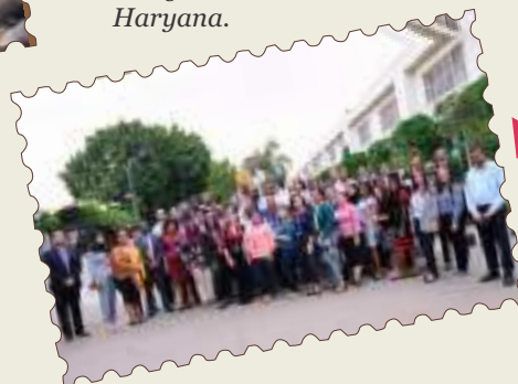
Visit of 68th PCFD participants to Hero MotoCrop, Gurugram.