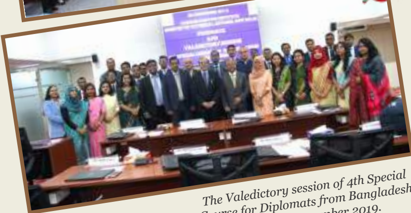
The Valedictory session of 4th Special Course for Diplomats from Bangladesh held on 20 December 2019.