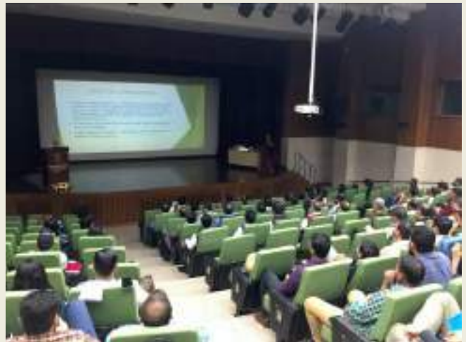
Accounts Training session in progress