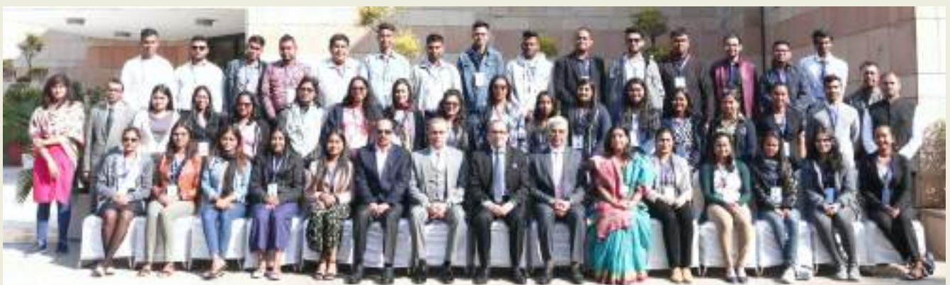
Participants of the 58th KIP visited FSI on 2 December 2019.